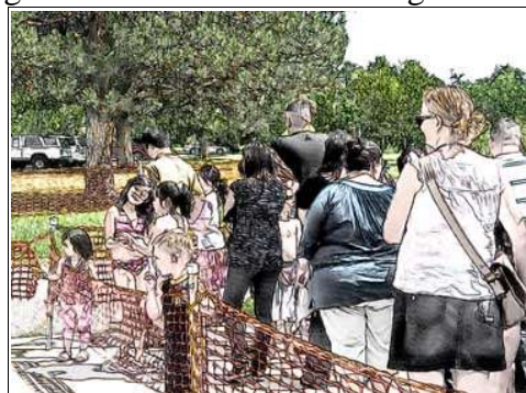
Patient crowds waiting for the J&S

The 4th of July weekend at Columbia Park proved busy for the J&S. At one point Sunday, we had 3 full train loads waiting a line that stretched down the length of the concession building.